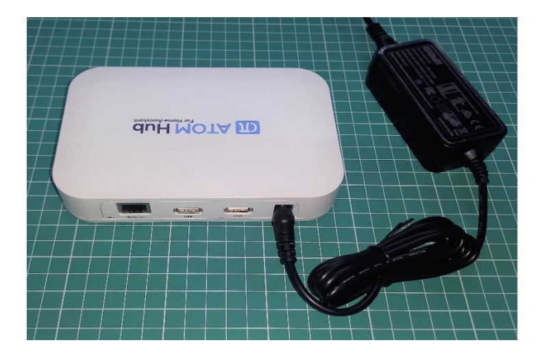
DO NOT switch on the power unless Ethernet wire is connected to the device.

• Take the 12V power adapter and plug it into the mains. Connect the adapter's DC Jack into the power jack located at the back side of the device.